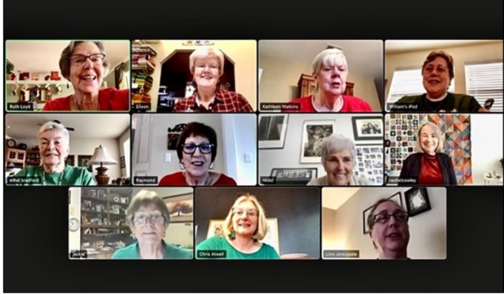
A Few Loose Threads Bee