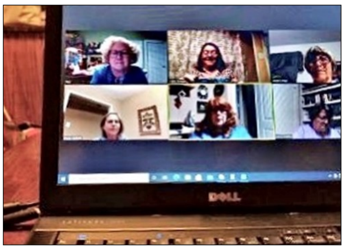
Pins and Needles Bee

Have you wondered whether our BCQG Bees are meeting during this pandemic? Yes, most of our bees are meeting. The pictures were taken at Zoom parties or at one of their bee meetings.